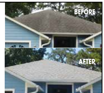
LOW PRESSURE - SAFE AND EFFECTIVE CLEANING PROCESS

Call Today! 352.318.0779 www.h2o-prospressurewashing.com